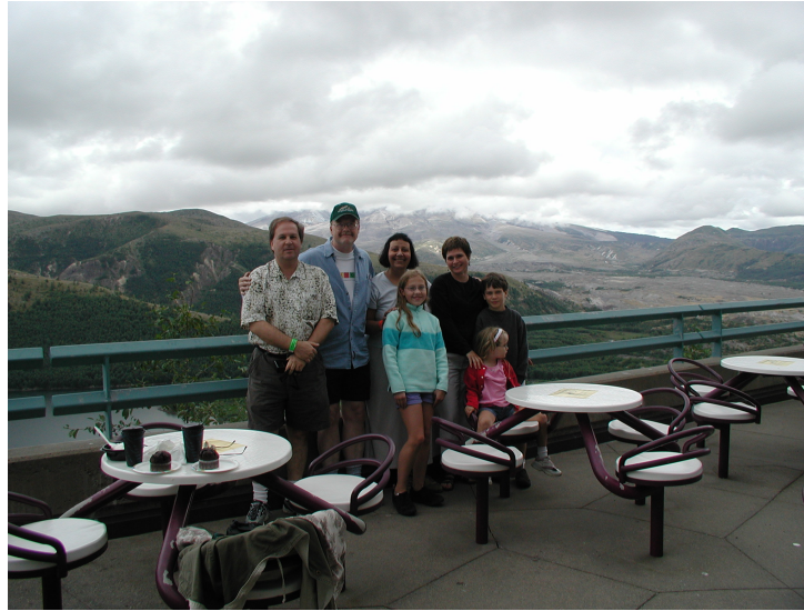
Mount Saint Helens

We also went to Mt. Saint Helen's. When we were there we saw a short film about the volcano and here's a quote that I learned at the movie: "Houston, this is it, this is it!". It was said by a man who was standing at a ridge near the base of the volcano when it erupted.