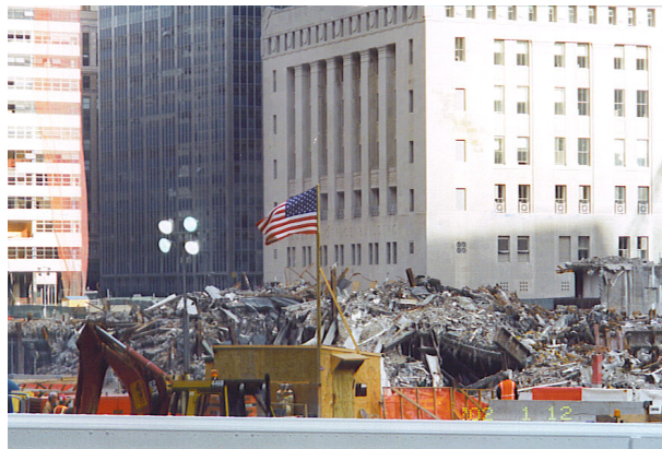
World Trade Center, New York